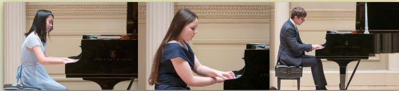
Students Concert #65

Performed at Carnegie Hall on January 17, 2025